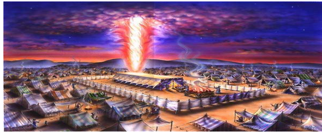
The Tribes of Israel and their March Orders