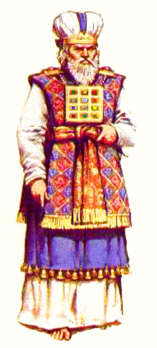
The High Priest

Today's Key Words is Priest A Priest was someone who represented Man to God