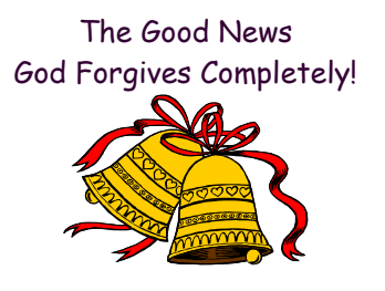
(Please fill in the blanks below)

God has provided the way to be saved so free and so easy that anyone can come, no matter how young or how old or how handicapped, or how bed bound. It doesn't matter to God! He showed His love for all by providing this free and easy way for all. It doesn't matter what you may have done wrong in the past, to others, or self. He will forgive unconditionally!