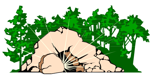
Sword Drill: John 20:1-18

After being punished for our sins, He breathed out and died and was taken off the cross, and placed in a new empty tomb. Three days later God resurrected Him from the dead. This is the first time in all human history that this has ever happened!